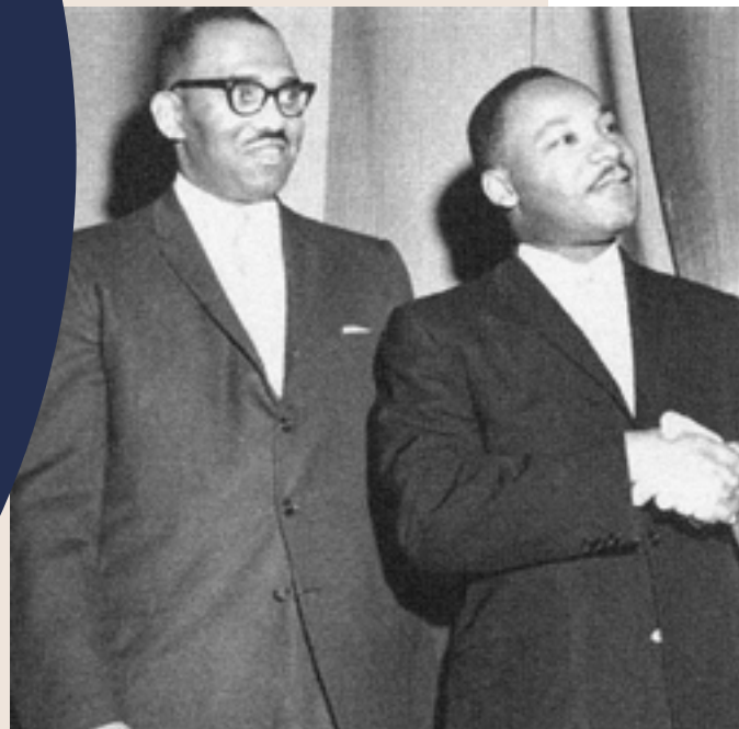
King tells the crowd.

“IN ORDER FOR DEMOCRACY TO LIVE, SEGREGATION MUST DIE,”